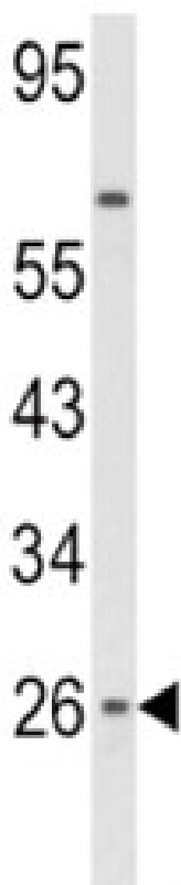
Western blot analysis of IFNB1 antibody and HepG2 lysate.