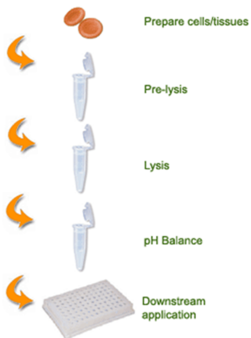
Fig 1. Schematic procedure for using the EPIXTRACT® Total Histone Extraction Kit.