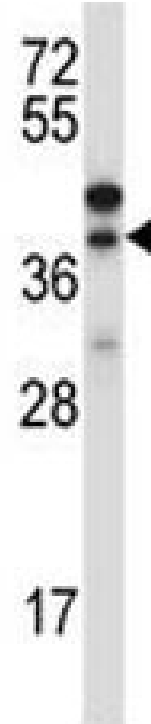
Western blot testing of CTGF antibody and NCI-H460 lysate