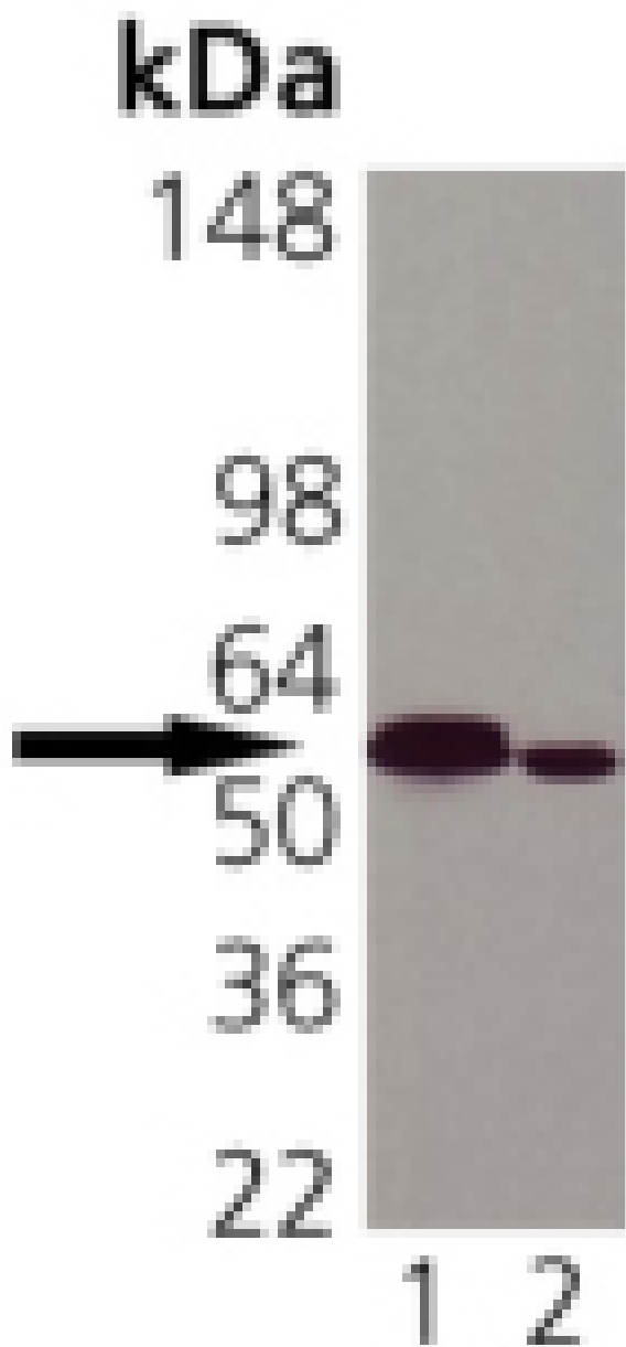
Western blot analysis of Calreticulin: Lane 1: HeLa (Heat Shocked), Lane 2: Vero.