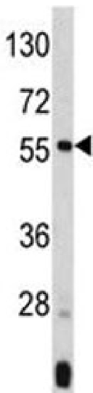
Western blot analysis of ANGPTL3 antibody and mouse liver tissue lysate. Predicted molecular weight 50 ~ 63 kDa depending on glycosylation level.